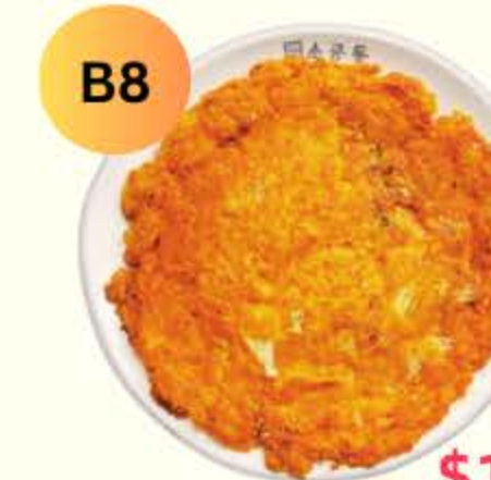
Kimchi Pancake 김치전