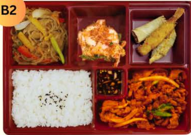
Pork Bulgogi Bento 돼지불고기 벤또 $18.99 Stir-Fried & Marinated Spicy Pork Bulgogi Bento