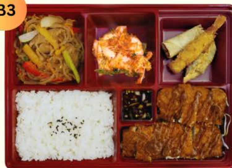
Pork Cutlet Bento 돈까스 벤또 $18.99 Pork Cutlets in a Special House Sauce Bento