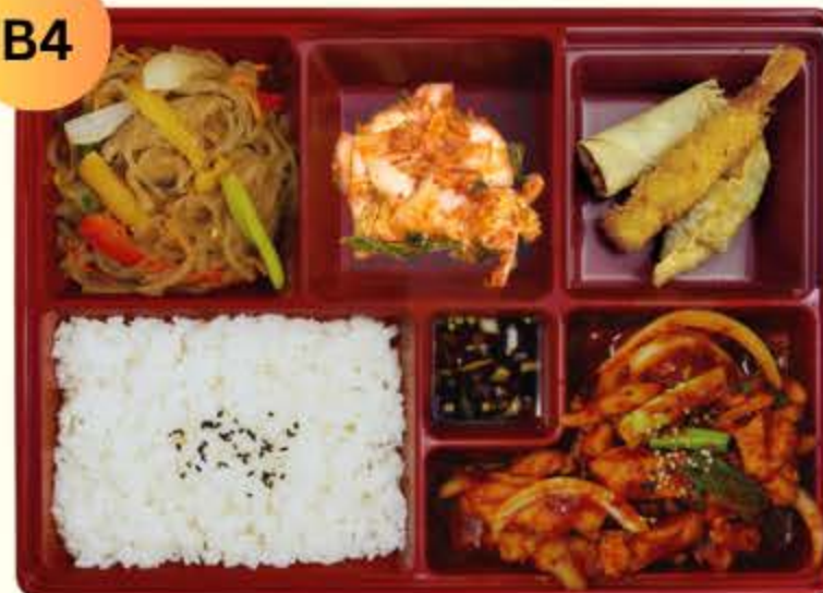
Chicken Bulgogi Bento Regular/Spicy 닭불고기 벤또 $17.99 Choose Between Regular or Spicy Stir-Fried Chicken Bulgogi Bento

All Bento Boxes Served with Rice, Soup, Fried Shrimp Tempura, Pork Dumplings, Vegetable Spring Roll, Japchae, and Kimchi.