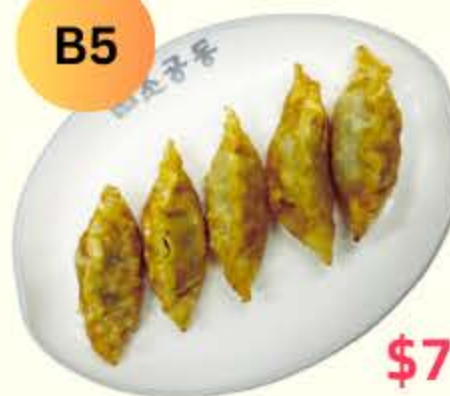
Fried Dumpling (5 pcs) 군만두