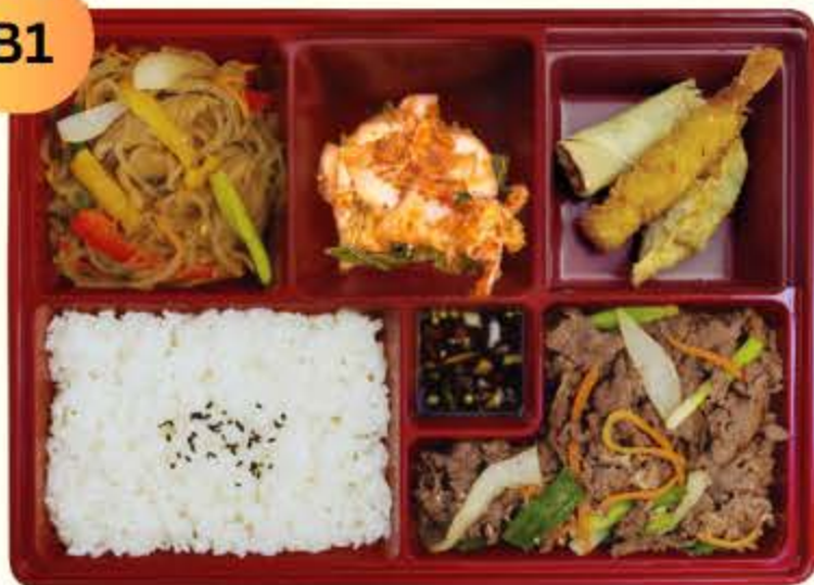
Beef Bulgogi Bento 소불고기 벤또 $19.99 Stir-Fried & Marinated Beef Bulgogi Bento