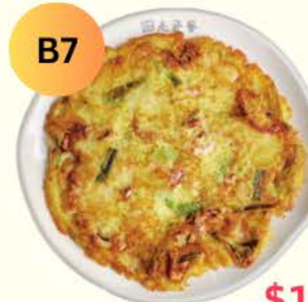
Seafood Pancake 해물 파전