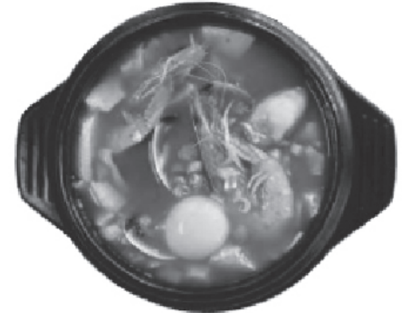
SEAFOOD SOONDUBU JJIGAE (Regular Spicy)