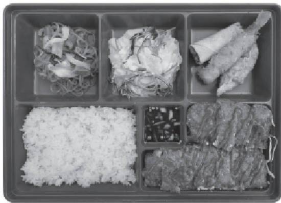
PORK CUTLETS BENTO